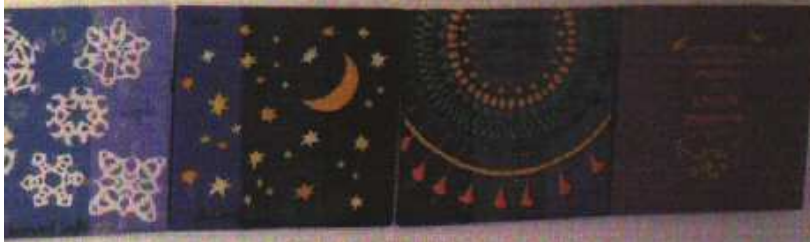
OVER THE RAINBOW... The finished piece will serve as a fitting tribute to the popular teacher